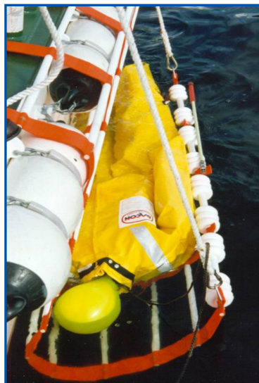
Dacon AS, 2008