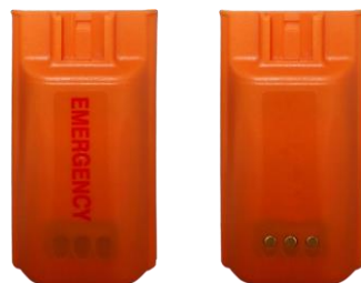
Battery Emergency / Rechargeable