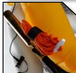
A floating buddy line