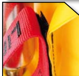
Lifting loop handle secured to bladder by Velcro.