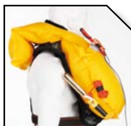
Unique moulded shape tailored to the contours of the wearer for comfort.