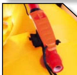
Marine grade ISO 12402 approved clip-on orange.